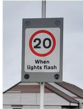
Part-time 20mph speed limit outside an Orkney island school in 2024

At this juncture, I would like to take the opportunity to quash the fake news that has been circulating in the Isles that agricultural vehicles are not permitted to drive through permanent 20mph zones. This is completely untrue. The only restriction applying to agricultural vehicles in 20mph zones is that their speed must not exceed 20mph, the same restriction that applies to any other vehicle. I request the originator of this rumour please to desist from spreading misinformation which only serves to undermine safety for everyone on our island roads.