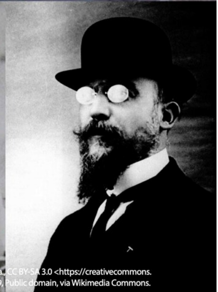
Ian Hamilton Finlay, Ernst Jandl, – Erik Satie (1865-1925) en 1909, Public domain, via Wikimedia Commons.