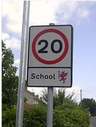
Permanent 20mph speed limit outside an English village school in 2015

You have probably noticed that the part-time, light-controlled 20mph speed limit signage around Isles schools has been removed. This was necessary for safety reasons owing to significant defects having been identified with the supporting poles. In order to maintain road safety, a road traffic regulation order was issued in The Orcadian of 5 th March to temporarily implement permanent 20mph speed limits in these areas. As I made clear from the very start of my campaign for Isles children to be afforded the same road safety standards around their schools as children elsewhere, I prefer permanent limits (as in the left-hand photo) over part-time ones (as in the right-hand photo), so I hope these will be retained in the long-term.